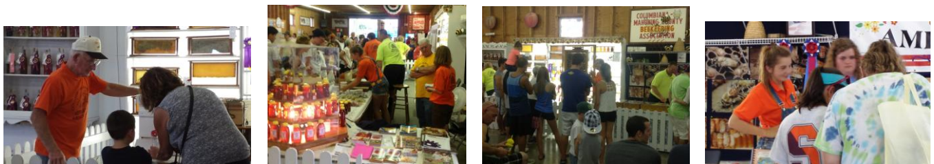
Educating and Offering Beeswax and Honey Products