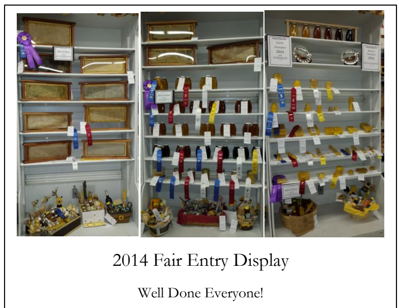
2014 Fair Entry Display