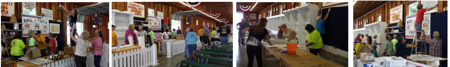
Setting Up the Booth