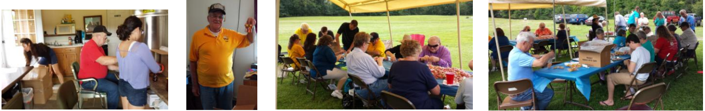
Bottling Honey & Counting Candy at the August Meeting

Thank you for the effort that all of you put forth preparing for, working during and cleaning up after the Canfield Fair! Thank you for taking the time to submit the beautiful entries that highlight our display and a special thank you to the Executive Committee members that spend countless additional hours to make this a successful event!