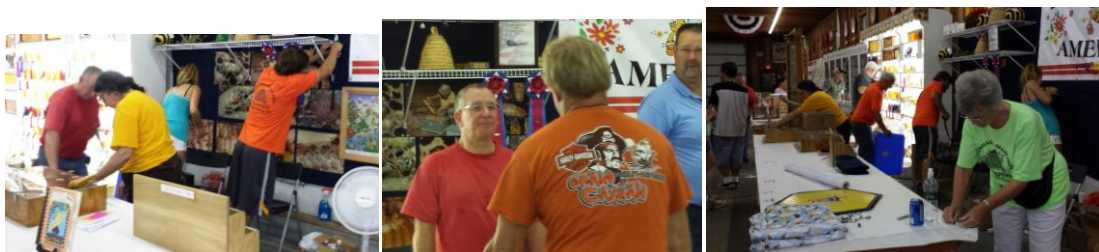
Monday Night's Clean Up